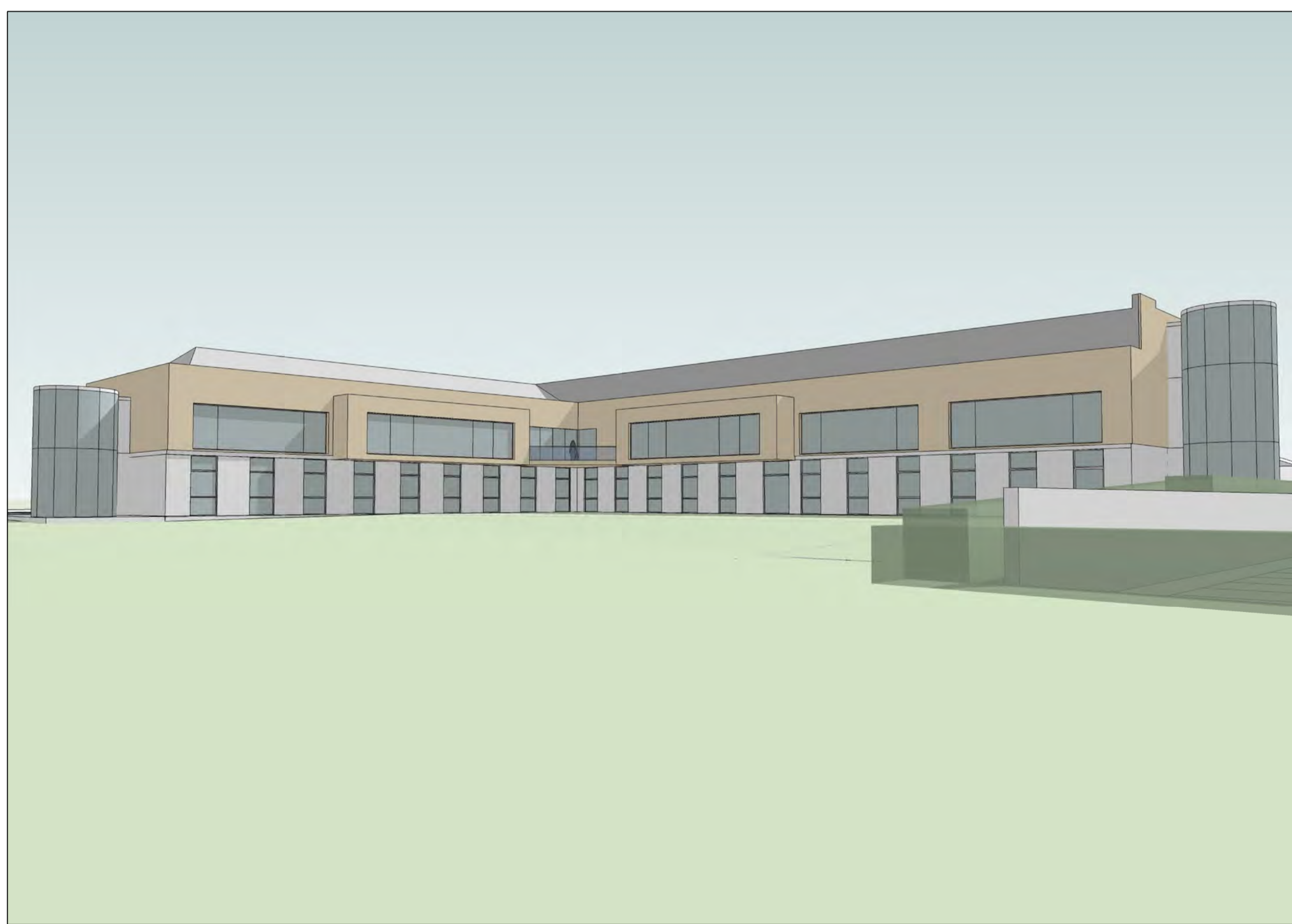
Garden view View from rear of hospital grounds 04