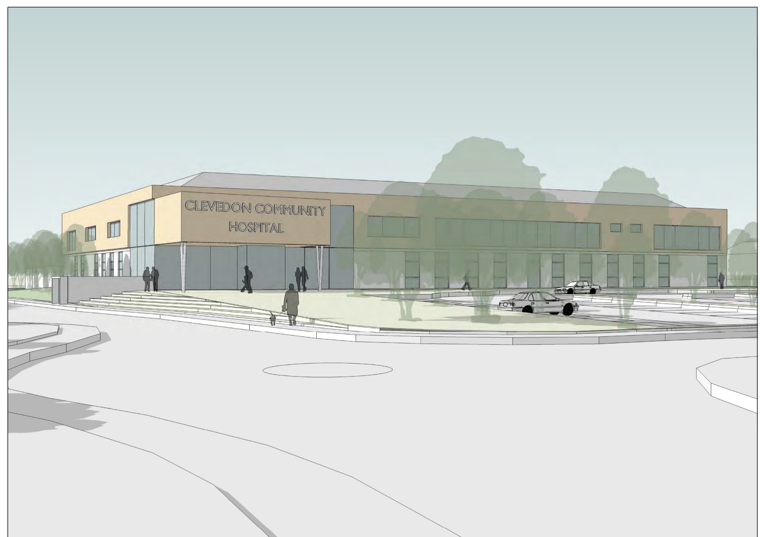
North Elevation Taken from opposite side of Millcross roundabout 01