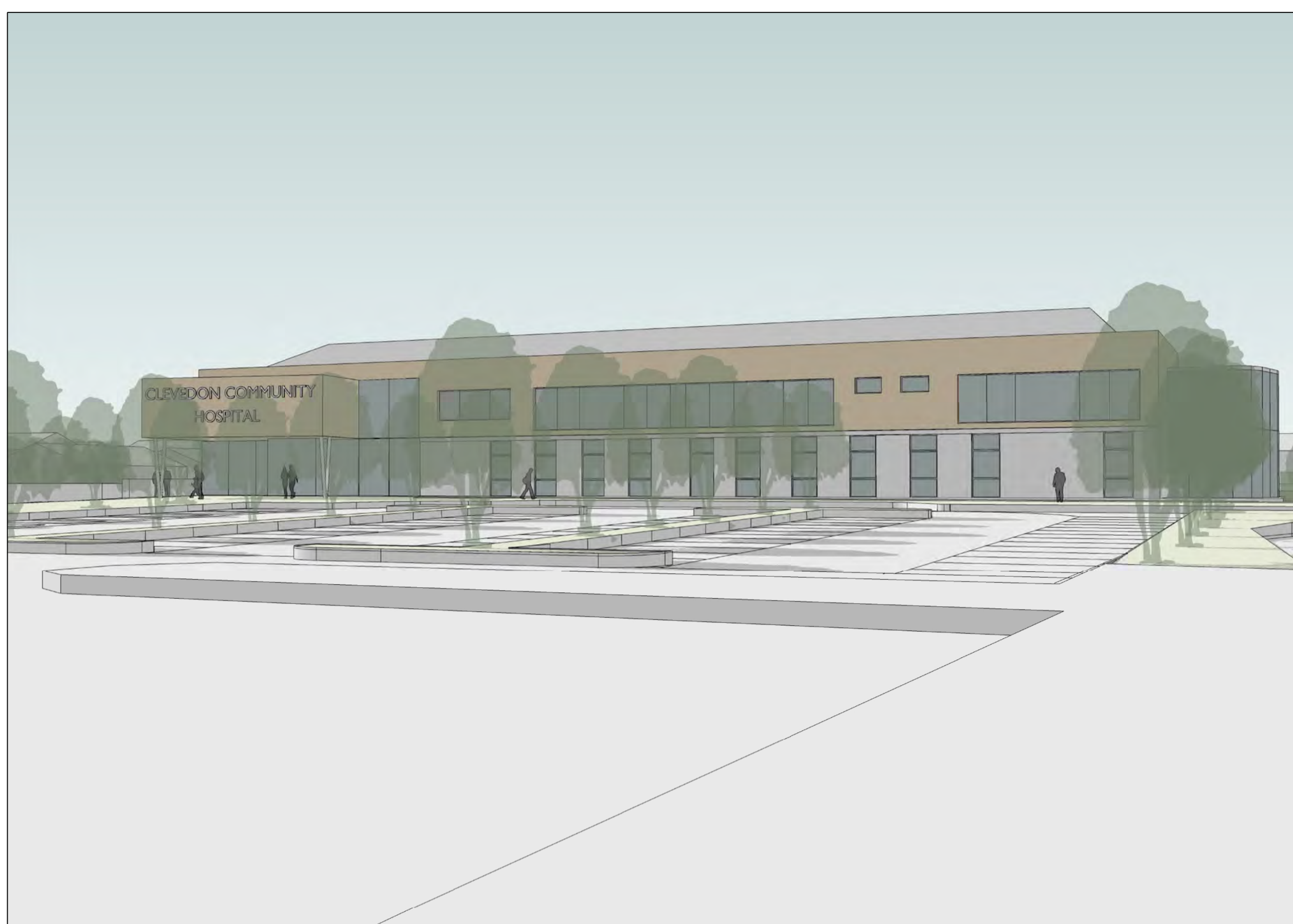
North Elevation The Crab Apple (Public House) car park 02