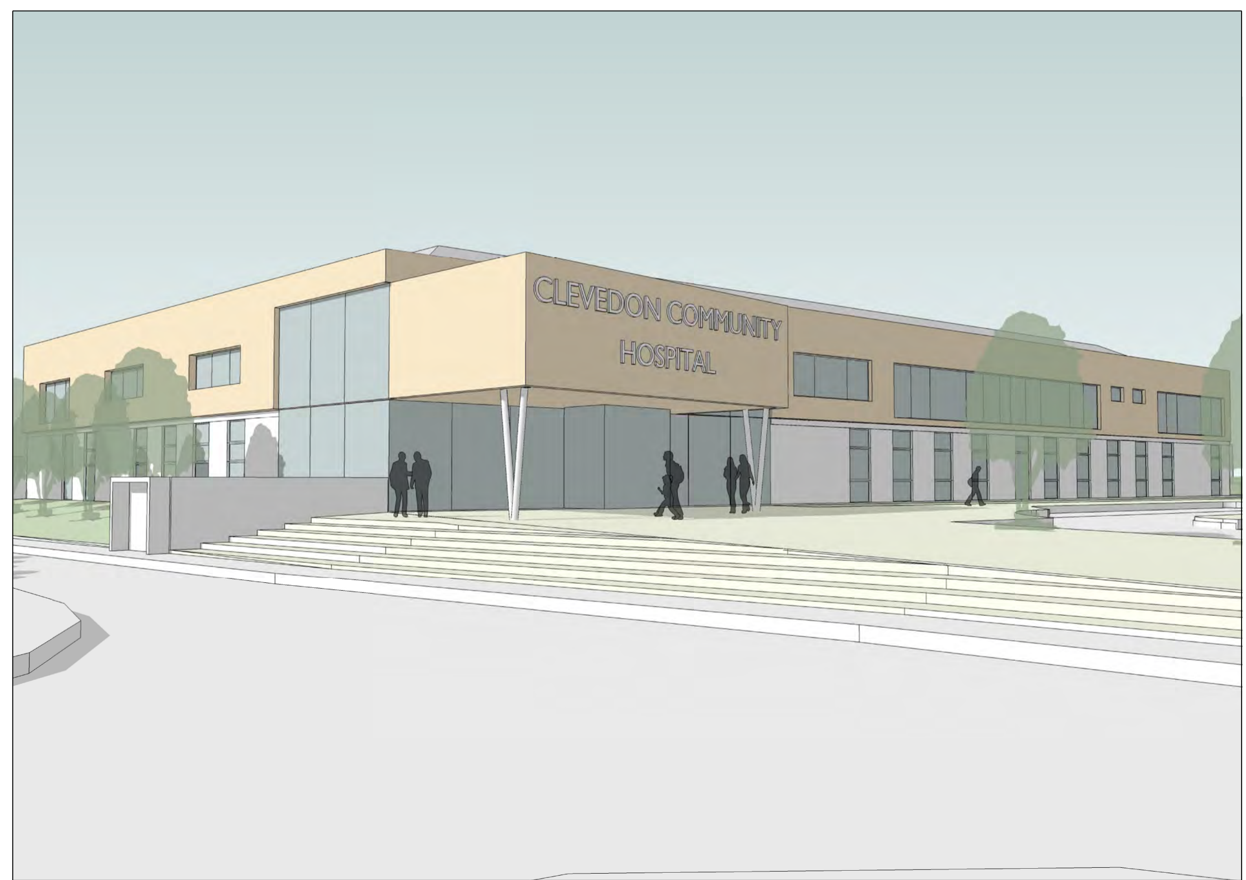
Main Entrance Taken from Millcross junction with Bryant Gardens 03